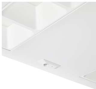
PowerBalance SC200 DPP