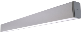
SlimBalance SP550P L150 Standard Product Photo