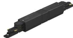
ZCS750 5C6 MPS BK (XTSC614-2)