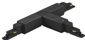
ZCS750 5C6 TCP BK