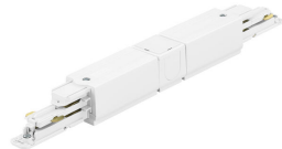
ZCS750 5C6 MPS WH (XTSC614-3)