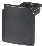
ZRS750 EP BK (XTS41-2)