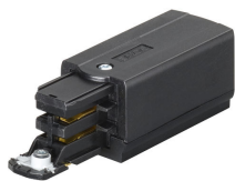
ZRS750 EPSR BK (XTS11-2+41-2)