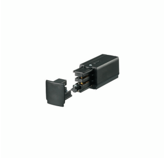
Power supply connector end left