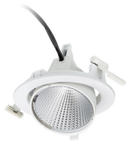
RS352B GreenSpace Accent Elbow White