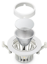
GreenSpace Accent Cardanic is fully serviceable and upgradeable