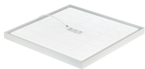
Ledinaire surface mounted SM065C back side DPP