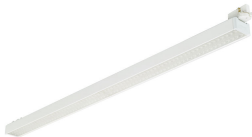
StoreSet Linear full length, white