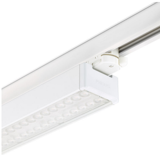
StoreSet Linear close-up track adaptor + endcap, white