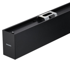
TrueLine Surface Mounted black housing