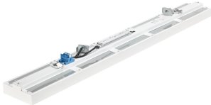
Maxos fusion Office DPP 2