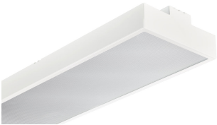
Maxos fusion Office DPP optics