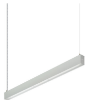
TrueLine suspended-SP530P SP532P L1130 ALU