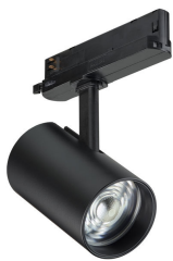
ST714T BK 12S TrueFashion2 compact-driver-in-track