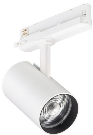
ST714T WH 12S TrueFashion2 compact-driver-in-track