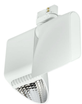
StoreFlow Double Spothead ST762T in white