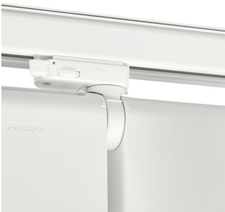
Tilt indications make consistent aiming of multiple spotheads easy