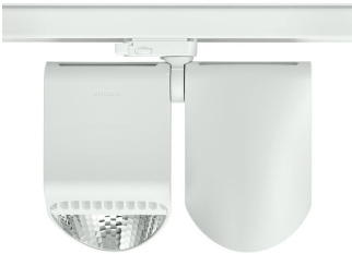
StoreFlow Double Spothead ST762T frontview white