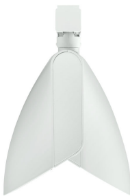
StoreFlow Double Spothead ST762T sideview white