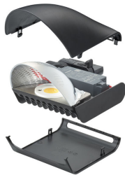
StoreFlow is easy to service due to its removable covers