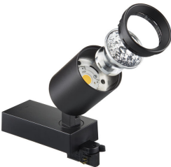
StyliD Evo Exploded View