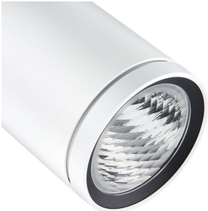
OptiShield protects the optical compartment from bugs and dust