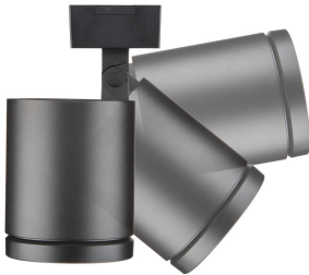
StyliD Evo Performance in white, full rotation flexibility