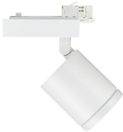
StyliD Evo Performance white, side view