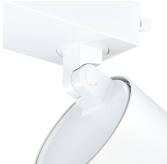
Aiming indication, with marking for Indoor Positioning operation