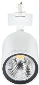
StyliD Evo Performance white, front view