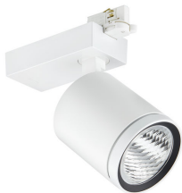
StyliD Evo Performance ST780T white, track version