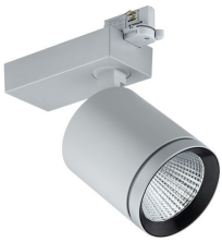
StyliD Evo Performance HR