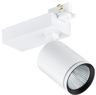
StyliD Evo Compact HR