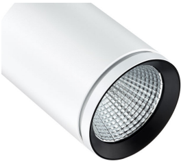
StyliD Evo Compact HR