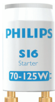
S16 70-125 W, WH