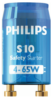
LPPR STARTER PHL 0003