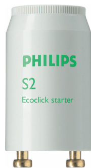
LPPR STARTER PHL 0004