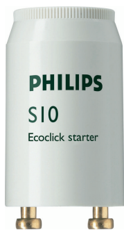
LPPR STARTER 0001