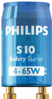
LPPR STARTER PHL 0003