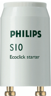
LPPR STARTER 0001