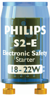
LPPR STARTER S2E BL PHL