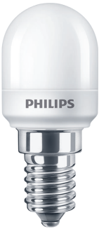
LED T25 E14 WW C1 POS1