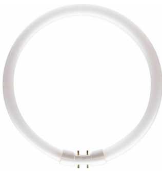
22 W Cool white Circular fluorescent - RFT