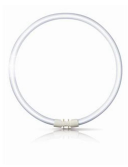
55 W 2GX13 Cool white T5 Circular fluorescent - RFT