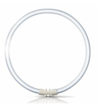
55 W 2GX13 Warm white Circular fluorescent - RFT