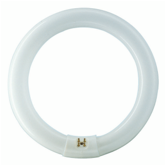
30 W G10q Cool daylight Circular fluorescent - RFT