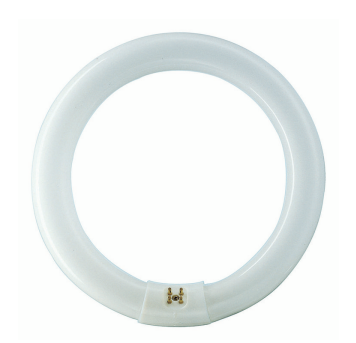
LPPR TL-ESTD G10q