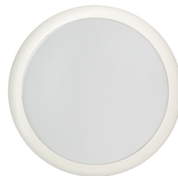
Ledinaire wall-mounted gen2 WL070V top view