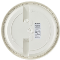
Ledinaire wall-mounted gen2 WL070V back view