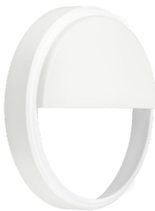
CoreLine Wall-mounted WL140V Half-moon Accessory White