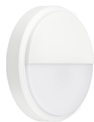
CoreLine Wall-mounted WL140V Wall-mounted White with Half- moon Accessory