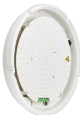
CoreLine Wall-mounted WL140V Wall-mounted Switchable Lumen & CCT