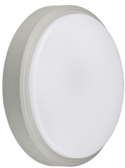
CoreLine Wall-mounted WL140V Wall-mounted Grey