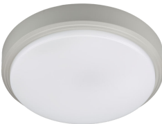
CoreLine Wall-mounted WL140V Ceiling-mounted Grey