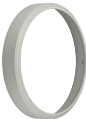
CoreLine Wall-mounted WL140V Rim Grey