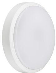
CoreLine Wall-mounted WL140V Wall-mounted