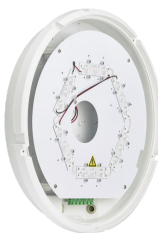
CoreLine Wall-mounted WL140V Wall-mounted PSU