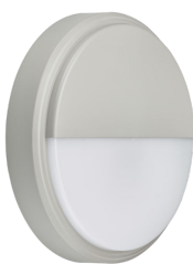
CoreLine Wall-mounted WL140V Wall-mounted Grey with Half- moon Accessory