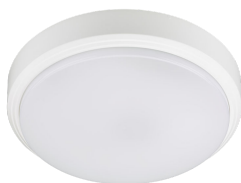
CoreLine Wall-mounted WL140V Ceiling-mounted