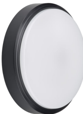
CoreLine Wall-mounted WL140V Wall-mounted Black