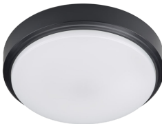
CoreLine Wall-mounted WL140V Ceiling-mounted Black