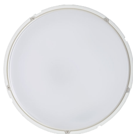
Coreline Wall-mounted WL140V Top View (with screw locations)