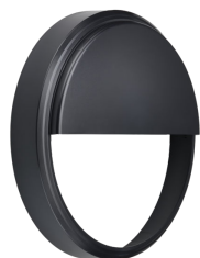
CoreLine Wall-mounted WL140V Half-moon Accessory Black