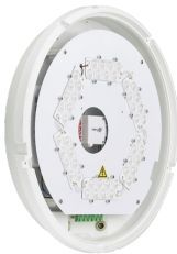
CoreLine Wall-mounted WL140V Wall-mounted PSR MDU