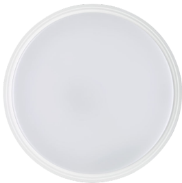
Coreline Wall-mounted WL140V Top View