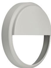
CoreLine Wall-mounted WL140V Half-moon Accessory Grey