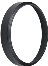
CoreLine Wall-mounted WL140V Rim Black