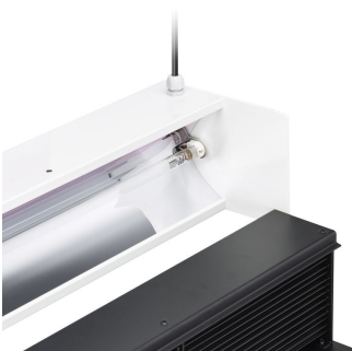
Access to lamp and product maintenance