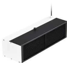
UV-C disinfection upper air Wall mounted version