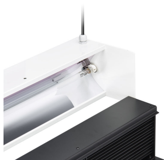
Access to lamp and product maintenance