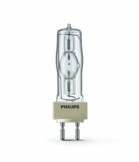
XPPR XDMSD 0013