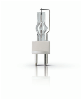
XPPR XDMSR 0017