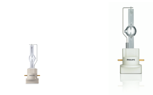
MSR Gold™ 1000 MiniFastFit