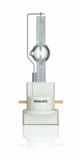
XPPR XDMSR 0015