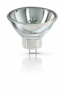
XPPR XHOPDI 0005