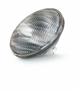
XPPR XPAR64 0002