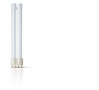
XPPR XUMPLL 2G11