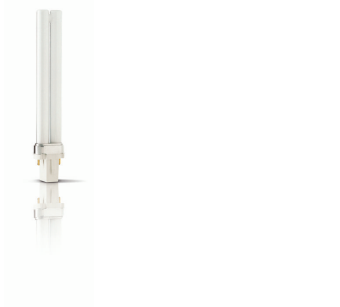
XPPR XUVBPLS 0001