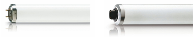
XPPR XUMTLRS G13