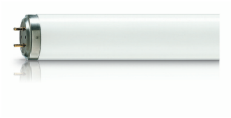
XPPR XURTL G13