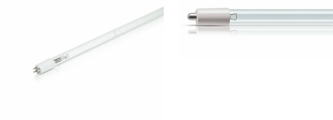
XPPR_XUTUV_0002-Product photo XPPR XUTUV 0004