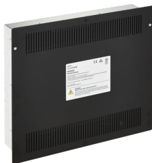
DH2x24, DIN Rail Enclosure