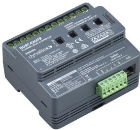
DDRC420FR Relay Controller