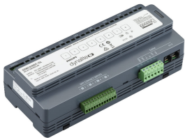
DDRC810DT-GL 8 x 10A Relay Controller