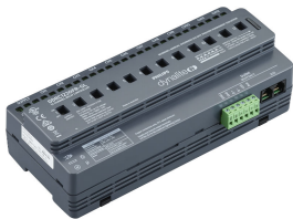
DDRC1220FR-GL 12 x 20A Relay Controller