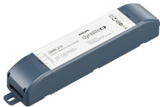
DYNET-STP-CSBLE-LSZH Data Cable