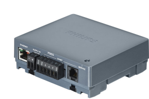
PDEG Ethernet Gateway