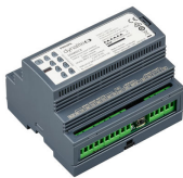
Product photo IRT9090_01