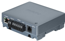
PDEG Ethernet Gateway