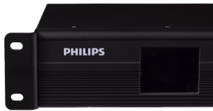
DMX stand-alone controller