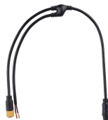
ZXP399 Y Connector