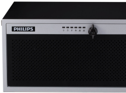
DMX main controller