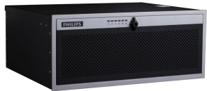
Main controller DMX