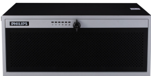
DMX main controller