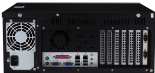
DMX main controller