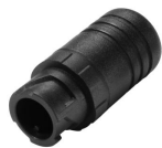
ZXP399 Endcap F