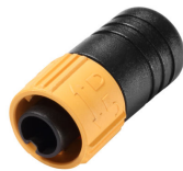
ZXP399 Endcap M