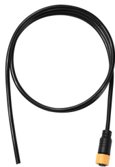
ZXP399 4P Leader Cable