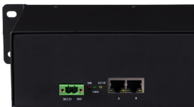
DMX stand-alone controller