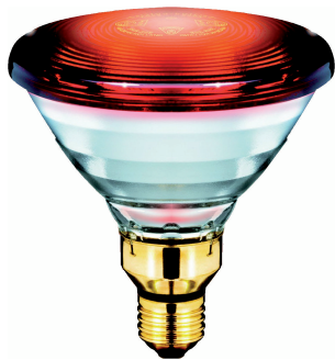
LPPR IRINPHI E27 PAR38